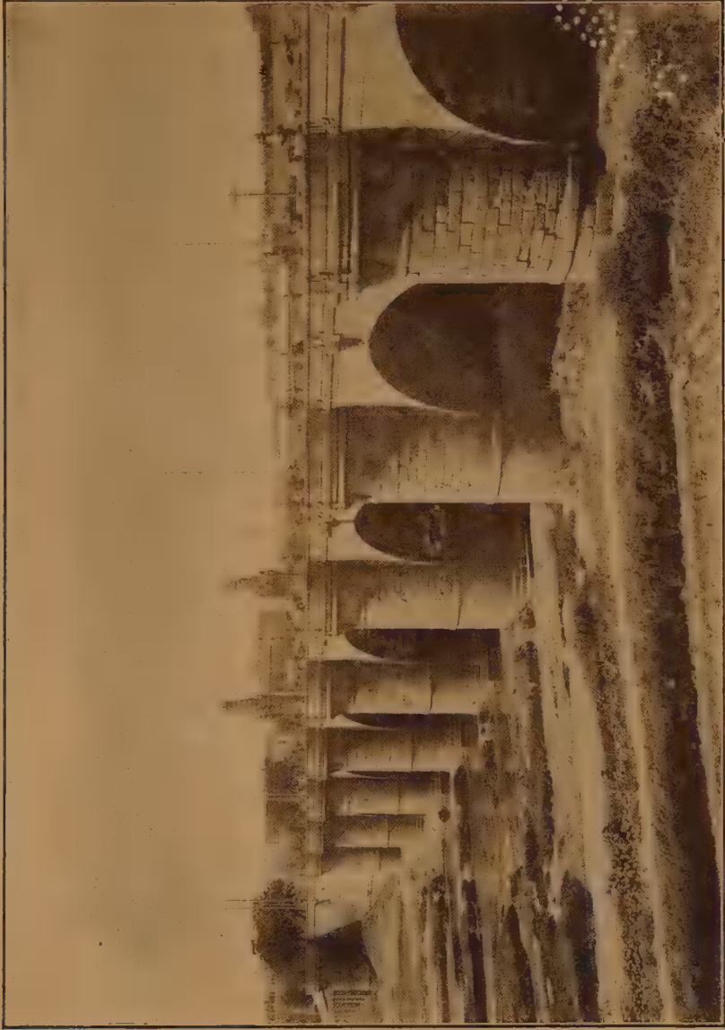
THE BRIDGE OF TOLEDO